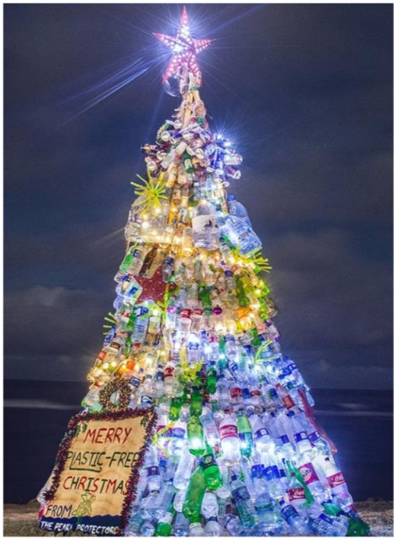
(Pet-bottle tree.from https://earthly.app/blog/the-pearl-protectors )

(1)to learn how to turn used-plastic bottles into materials for art. (2)Students will practice skills to use small wood-burner to design the pet-bottle arts and make pet-bottle sculpture of their choice and make one big pet-bottle tree(or big object of their choice) as group project to install in community area to involve community into this matter to reduce plastic waste. (3)Students will learn how to manipulate plastic bottles and examine how to utilize the material for future lesson.(4)Learn to use plastic in meaningful ways also reduces waste, helps the environments.